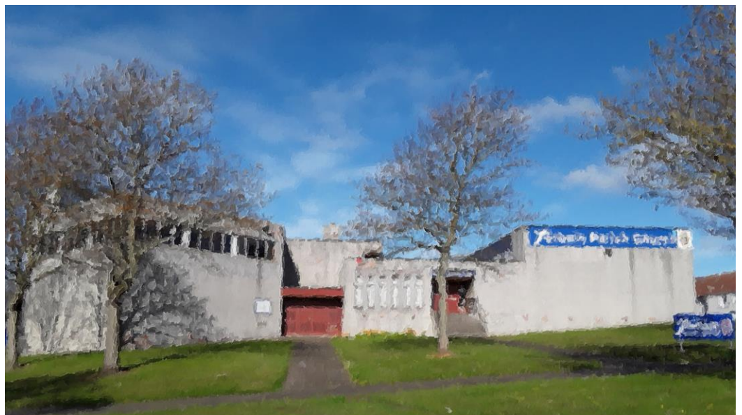
Templehall and Torbain United Parish Church Kirkcaldy Templehall and Torbain United Parish Church of Scotland

www.torbainchurch.org www.templehallchurch.com